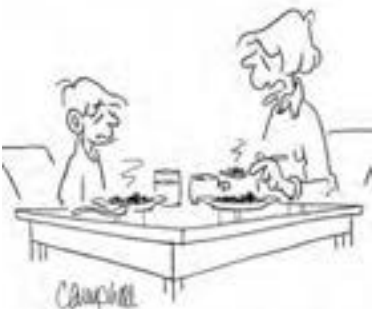
"These are vegetables, mother. You wouldn't want me to eat something I've given up for Lent, would you?"